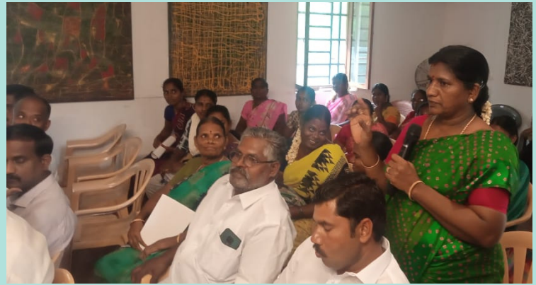
Participants sharing bio-resource knowledge.