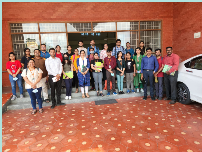
Interns pose for a photo inside TNBB complex.