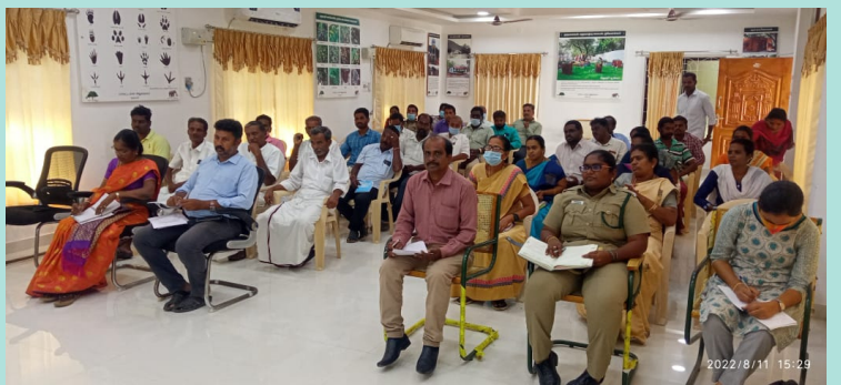
Participants present during the interactive session.