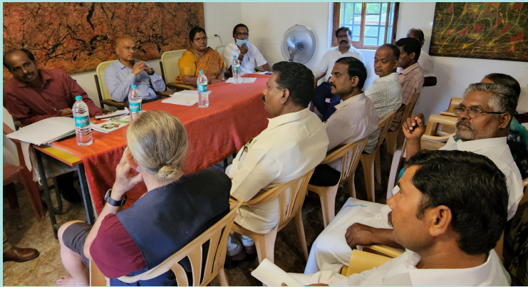
PCCF &amp; Secretary interacting with participants.