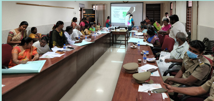
Participants engaging in the post-session PBR activity.