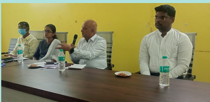
PCCF &amp; Secretary interacting with participants.