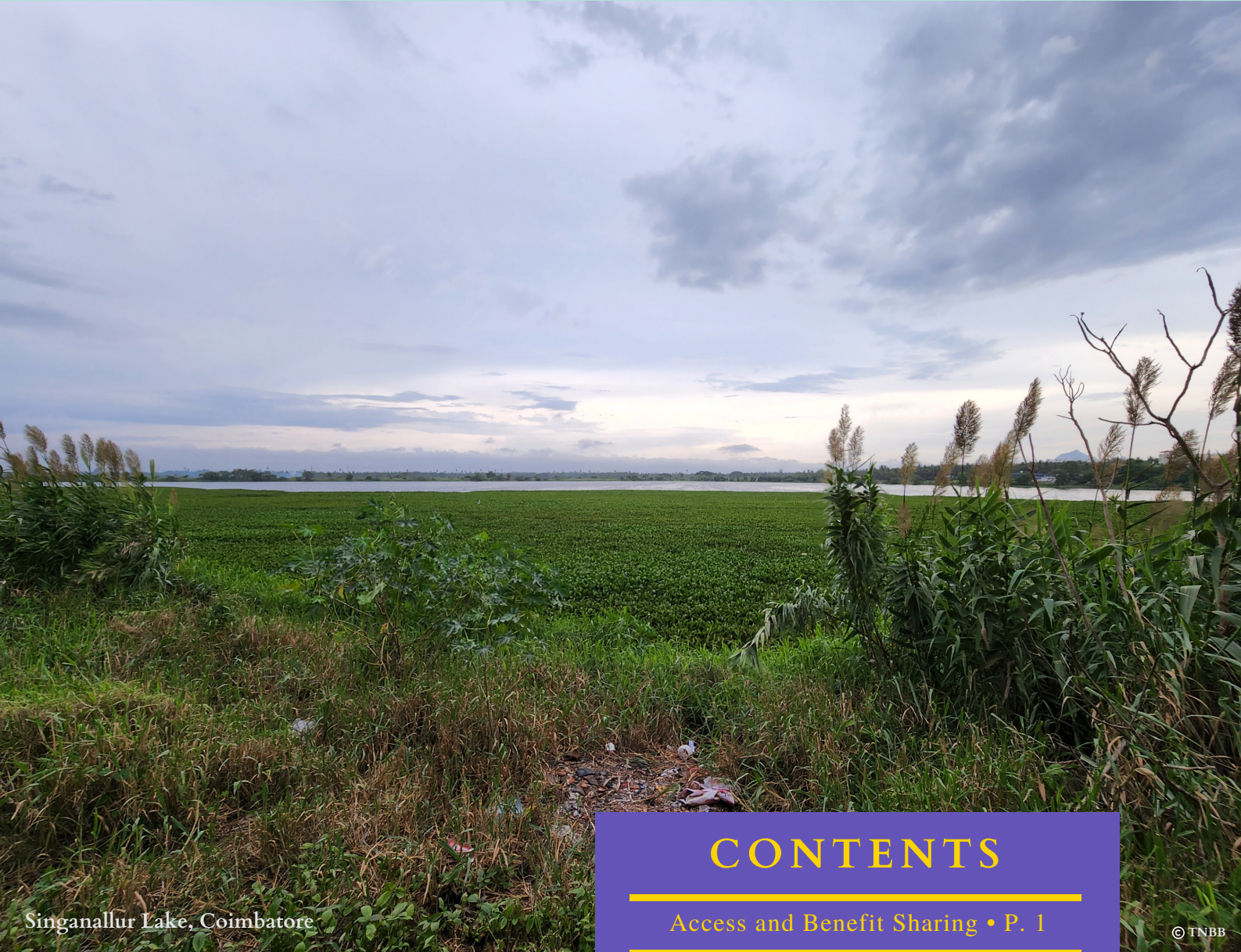
Singanallur Lake, Coimbatore