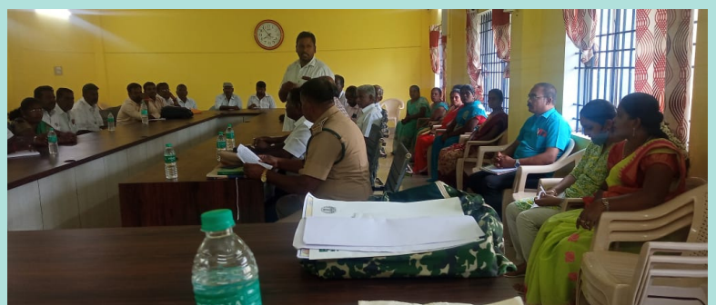
Participants sharing bio-resource knowledge.